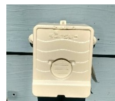
Radio Read Box

WTMA is in the process of replacing touchpad readers with a radio read box. The radio read boxes will allow the Authority to obtain meter readings using radio frequency technology instead of the traditional "walk around" method. The radio read technology will increase efficiency and eliminate the need for Authority personnel to enter your property to read your water meter. Entry to your home or business for the replacement is not necessary because all of the work can be done from the outside by Authority employees. Authority employees will be carrying identification tags and wearing bright yellow shirts or jackets.