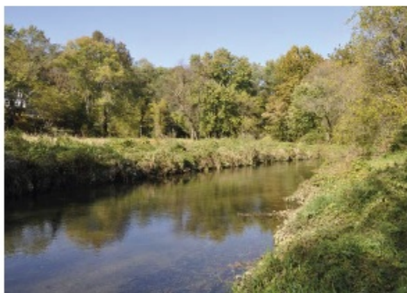
Pre-Restoration Site Conditions

Based on preliminary design completed by the U.S. Fish & Wildlife Service, the project will include the installation of 1,004 feet of moundsills, 6 cross vanes, 4 vanes, 288 feet of brush matting and 426 feet of rock toe, as well as volunteer planting of riparian buffer vegetation.