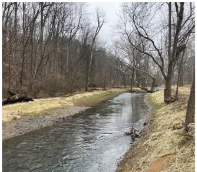
Recently Completed Habitat Restoration

As part of the Township's Municipal Separate Storm Sewer System (MS4) Permit, it is required to implement Best Management Practices (BMPs) to reduce pollution discharge to the waterways. This restoration project is a BMP that will achieve significant sediment and nutrient reductions that fulfill MS4 permit requirements.