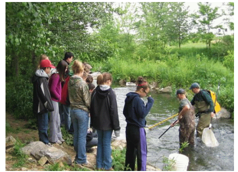
Watershed Day 2010 - Riparian Park

WTMA and Warwick Township encourage all farmer in the water recharge area to adopt “best management practices”. Periodically, information about what you can do to enhance Wellhead Protection will be enclosed in your quarterly billing. We encourage you to read this information when it is provided and to do your part in protecting our water supply.