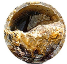
Pipe impacted by FOG