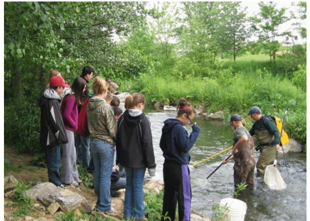
Watershed Day 2010 - Riparian Park

In accordance with our Wellhead Protection Program, WTMA continues to encourage people to take positive steps that will protect our water supply. One initiative is to join with other organizations in supporting the Lititz Run Watershed Alliance's Water Day event for all Warwick School District fifth grade students. This educational event provides hands on activities for students to experience the importance of protecting our water supply. WTMA continues to look at positive steps that can be taken, both by our municipalities and citizens, to protect our water supply. In addition to continuing public education, WTMA and Warwick Township encourage all farmer in the water recharge area to adopt "best management practices". Periodically, information about what you can do to enhance Wellhead Protection will be enclosed in your quarterly billing. We encourage you to read this information when it is provided and to do your part in protecting our water supply.